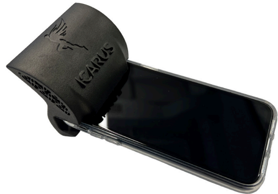
Figure 1. The Straight Shot should slide onto the top of the device and over the glass, with the mirror facing the rear.

We recommend that a chair be placed near the patient's opposite leg, providing them with an object to hold on to for stability during the scan. Ensure that the object is placed in a way that it does not interfere with the scan. Patients should wear shorts that fall around 9" above their knee for best results.